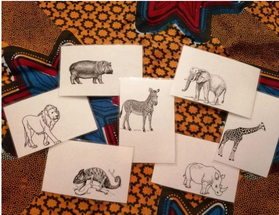
Image of some laminated cards used in pile sorting activities.